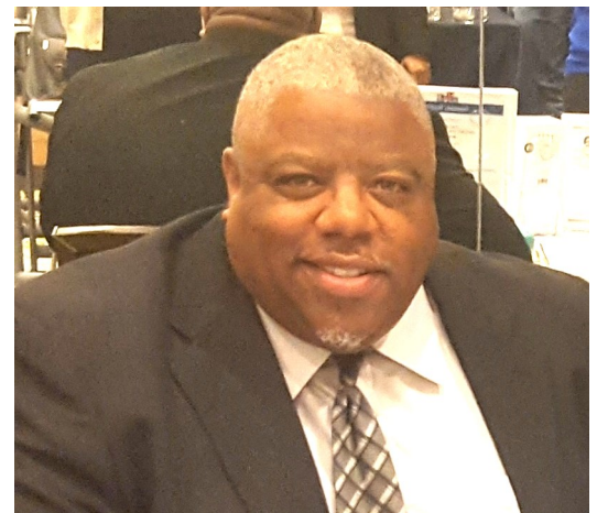
This picture was taken on March 29, 2017, at the

It is encouraging to witness the success of an association when all parties understand their duties and work together toward a common goal of improving their community. This Office understands its role in helping maintain that type of amicable environment between key players.