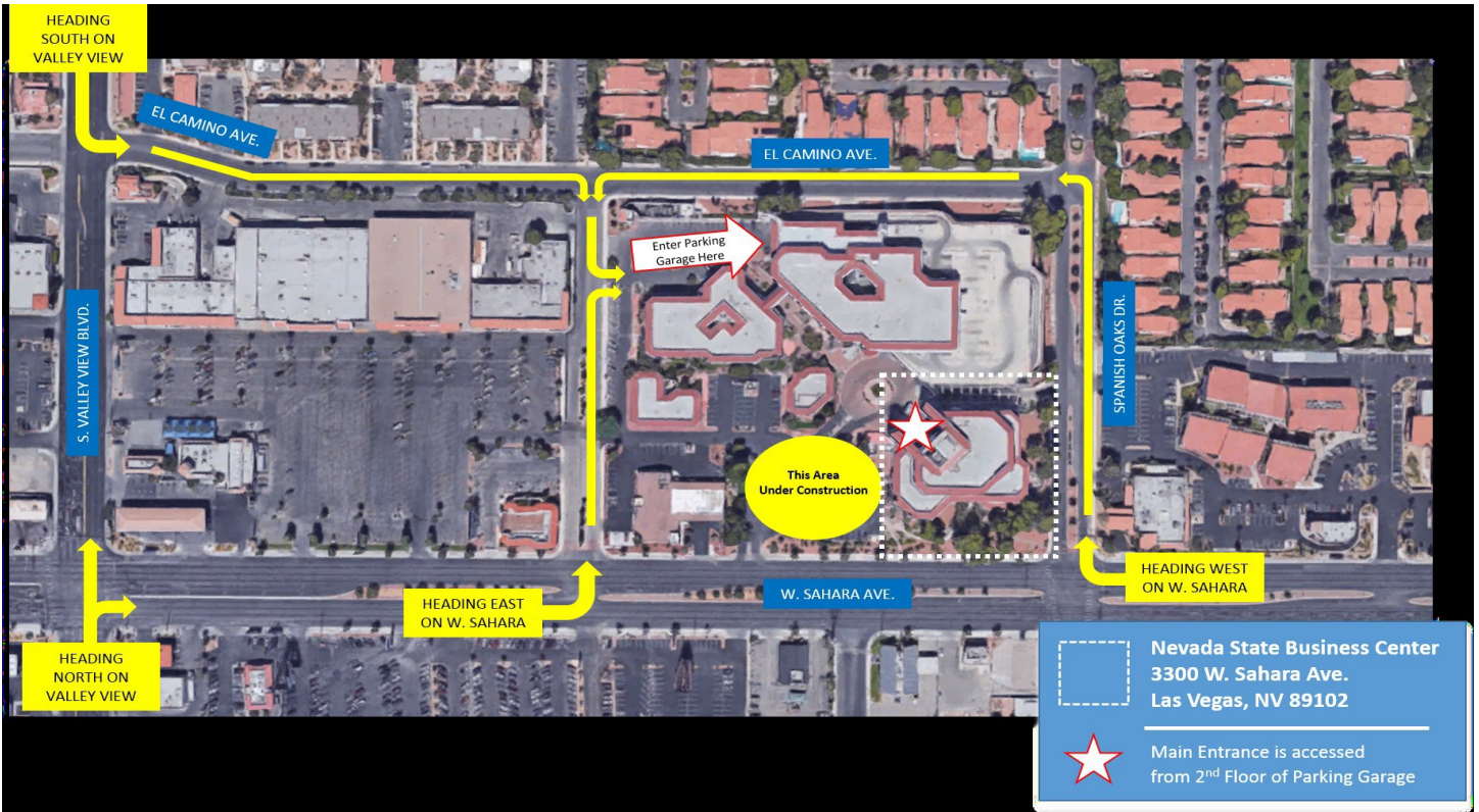
Map of how to access our new office.