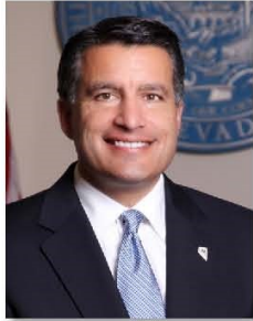
Brian Sandoval Governor State of Nevada

Conference featured speakers and master of ceremonies