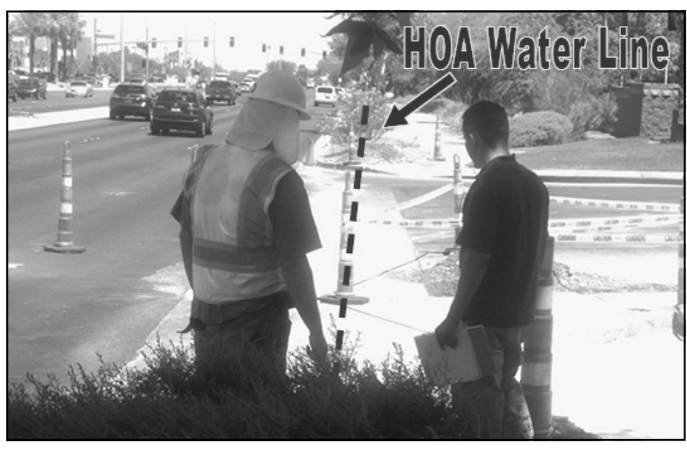
Just as homeowners need to know where their utility lines are, so do HOAs.

Using the 811 system is required by law per Nevada Re-